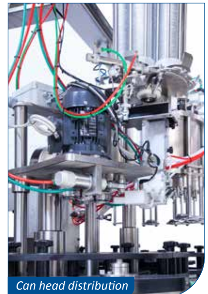
Can head distribution