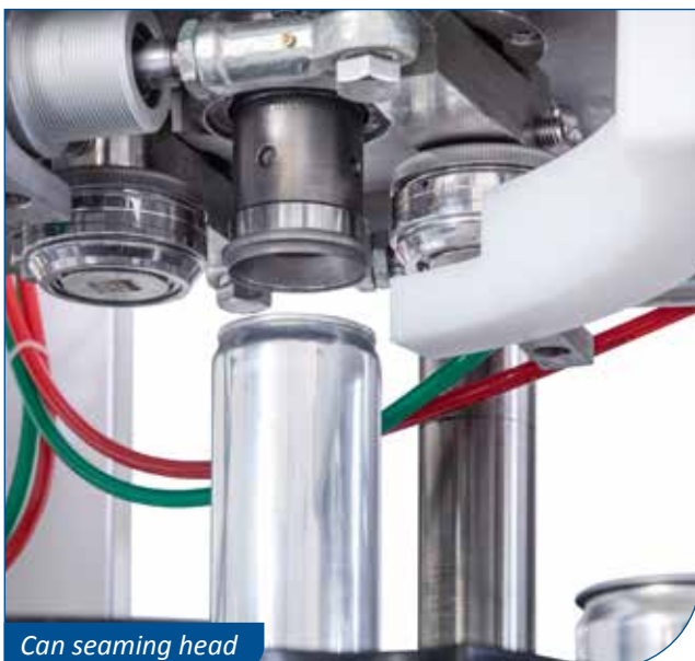
Can seaming head