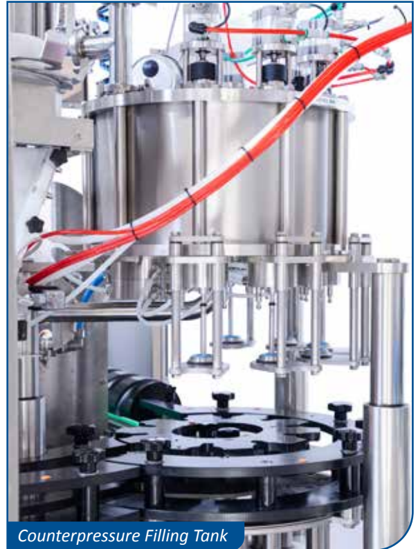
Counterpressure Filling Tank

This model is available to fill both glass bottles, aluminium bottles and aluminium cans.